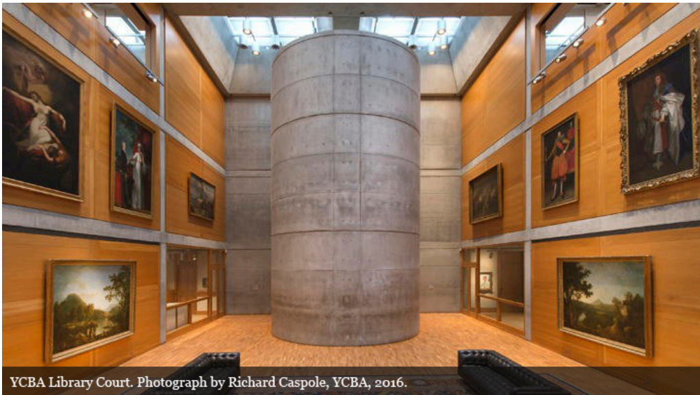
YCBA Library Court.